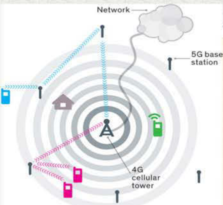
Figure [1] - Smart City