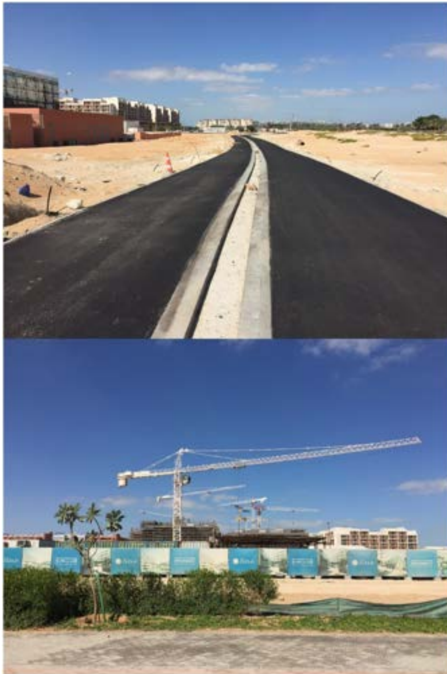
Fig. 7. Ongoing construction at Masdar City in February 2019.

which has an economic rather than environmental mandate, the socio-political context of the UAE and the impact of oil market volatility on Abu Dhabi's investment priorities. Although the underlying reason for Abu Dhabi's initial establishment of the Masdar Initiative and investment in Masdar City has been posited as a ploy by the UAE for political legitimization [41], the country has not been shy about its use of soft power to influence international opinion [42,43]. Further, the initiative and city undeniably created an opportunity for the country to take initial steps in transitioning from what has been coined as "petro-urbanism" [41] to sustainable development.