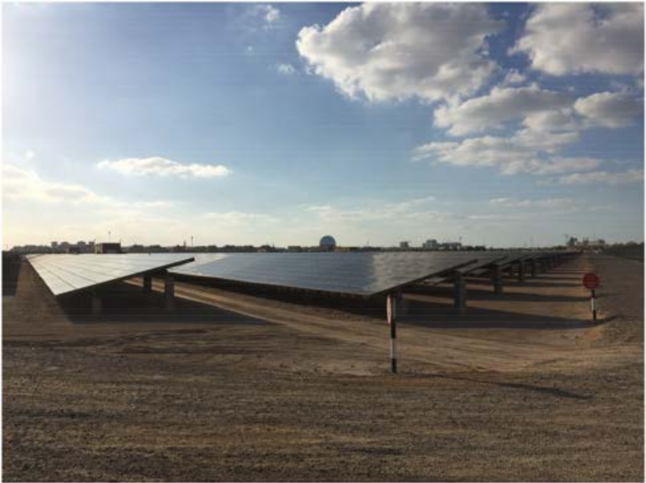
Fig. 8. A 10 Megawatt(MW) solar photovoltaic power plant at Masdar City.

and its surrounding initiative were influencing awareness of sustainability regionally and globally [22] and since that time, environmental sustainability initiatives in Abu Dhabi have progressed significantly. Before the establishment of Masdar, Abu Dhabi heavily subsidized energy and water, had no sustainable rating system for buildings and had a power system almost 100% reliant on fossil-based energy resources [47]. Fast forward a decade later, and Abu Dhabi has become a regional leader in energy subsidy reform, renewable energy deployment and sustainable buildings [47,48]. Masdar spearheaded the UAE's first renewable energy policy in 2009 and it established precedence for large-scale renewable energy projects in the GCC through development of the Shams 1 Concentrated Solar Power (CSP) plant, which is a 100 MW facility that started operation in Abu Dhabi in 2013 [49]. As a testament to Masdar's influence on sustainability in the UAE, the UAE government officially highlights Masdar City and the broader Masdar Initiative as one of the pillars of the country's response to climate change [50].