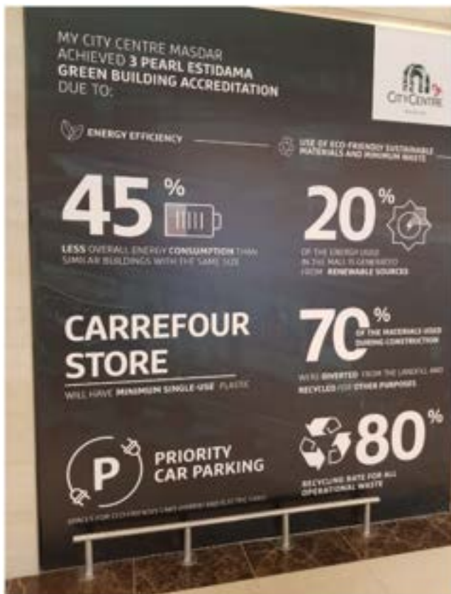
Fig. 6. Carrefour at My City Centre in Masdar City.