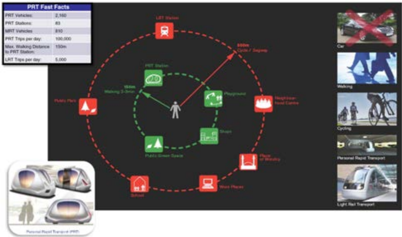
Fig. 5. Masdar City objectives in 2008 for transportation. Source: [25].