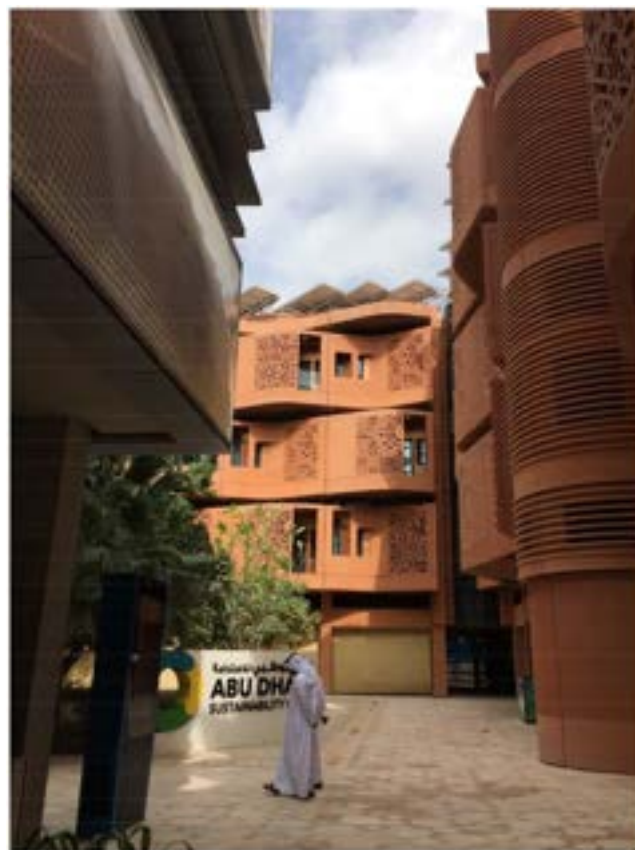
Fig. 4. Sustainable materials in use at Masdar City.

This plan no longer exists, however, and rather the city is promoting the use of electric vehicles and shuttles along with walking and other