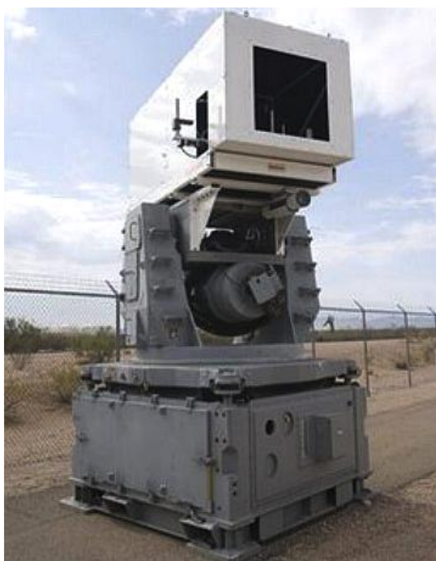
Figure 1: Laser Module [3]