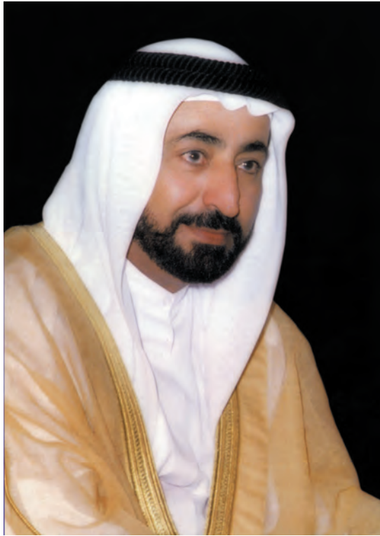
His Highness Sheikh Dr. Sultan Bin Mohammad Al Qassimi

Supreme Council Member, Ruler of Sharjah Founder and President of American University of Sharjah