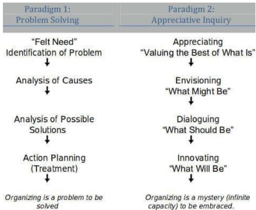
Figure 1: Comparison of AI and Traditional Problem-Solving Approaches (Moore, 2022)

be attained through approaches that affirm and accelerate learning (Cooperrider et al., 2008, as cited in Kaplan, 2014). AI centers on what is going well and then capitalizes on that to improve the situation and achieve successful results. A comparison between an AI approach vs a general more traditional problem-solving approach is depicted in the figure below. Figure 1 demonstrates a comparison between traditional problem-solving approaches and AI.