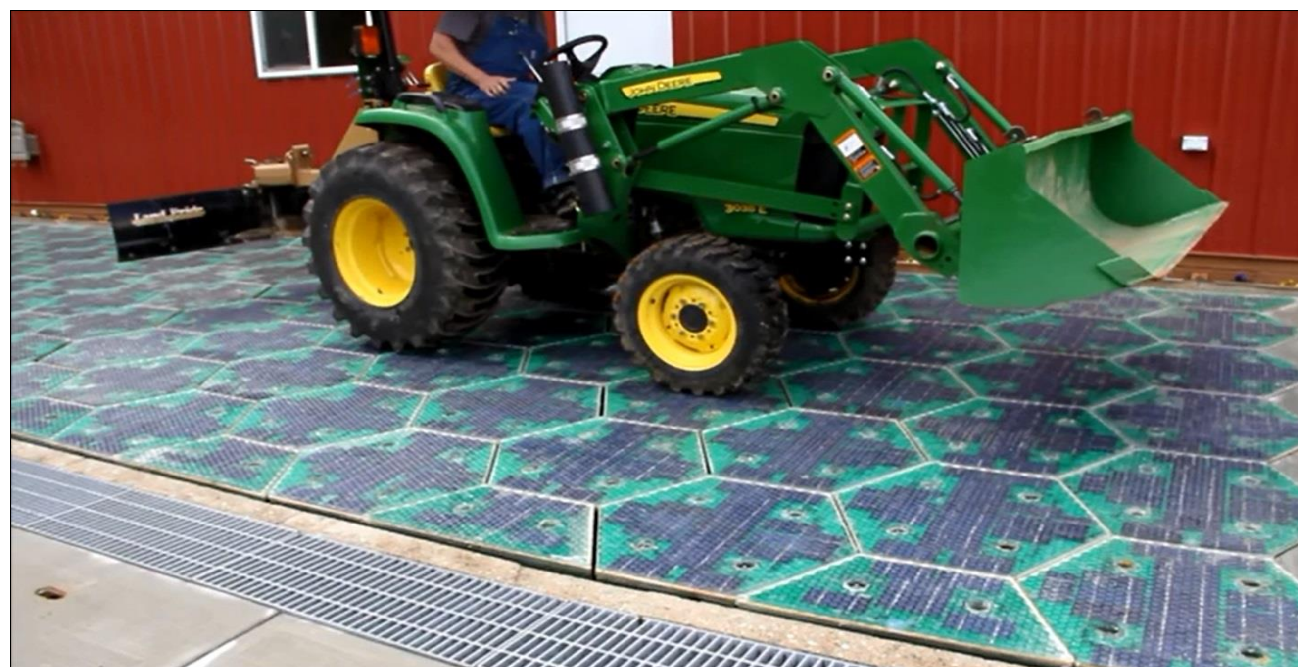
Figure 1 : Load bearing of solar panels [1]

The goal of this research project is to replace the current asphalt roads with an alternative that will make use of the thermal energy both from the sun's heat and the friction from car tires that was previously wasted on heating up the asphalt. Apart from that, this alternative will also be used to harvest unused solar energy. This alternative is solar roadways; extremely durable and high-load bearing solar panels modified to be able to harvest both thermal and solar energy. This alternative will also address many of the other issues faced due to using asphalt in road construction.