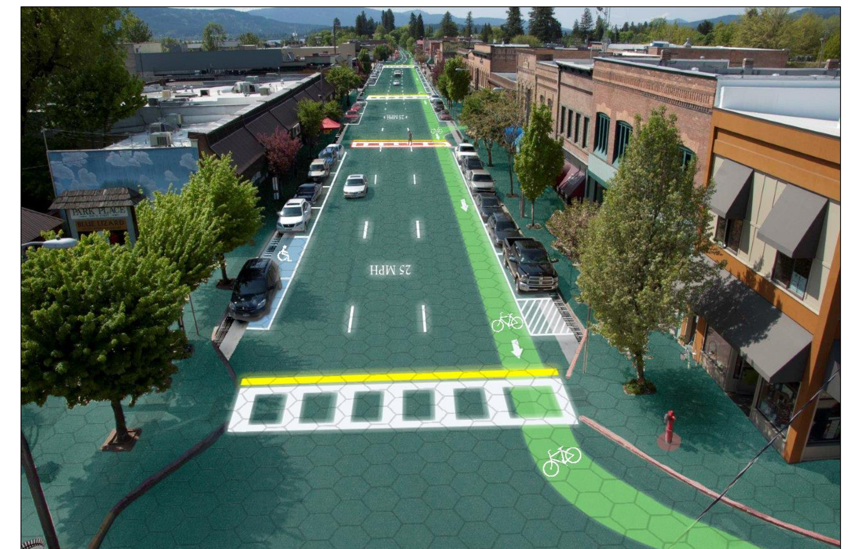
Figure 3 : LED view [1]