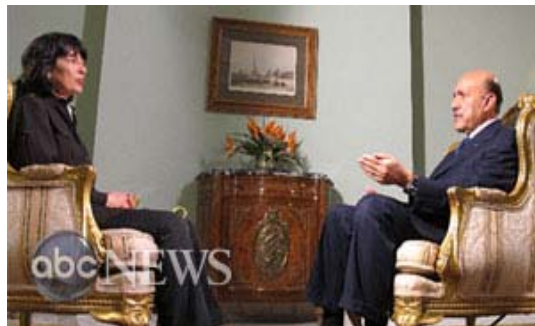
Figure 2: The New Vice President Suleiman Speaks: 'Egypt will not be anything like Tunisia'.

The following headline appeared on ABC NEWS on the 3 rd of Feb, 2011: